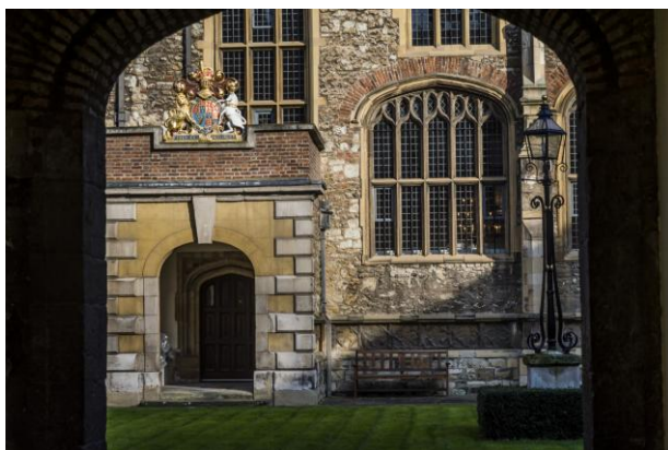
Master's Court

In 1371 Sir Walter built a Carthusian monastery on the site, one of several others in the country but granted a special status as a result of its London location. It became renowned as a place of religious learning, and Sir Thomas More studied here in the 16 th century. In 1535 the Prior of the London Charterhouse, John Houghton, was hung drawn and quartered at Tyburn, following his and other monks' refusal to sign the Act of Supremacy which affirmed King Henry VIII's position as Supreme Head of the Church in England. Prior Houghton's shoulder was nailed to the gate of the Charterhouse as a warning to those who remained.