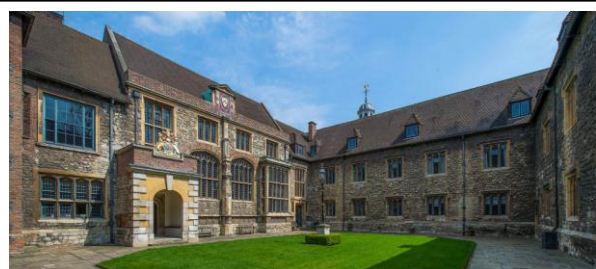
Master's Court

Website: http://www.thecharterhouse.org/visit-us/